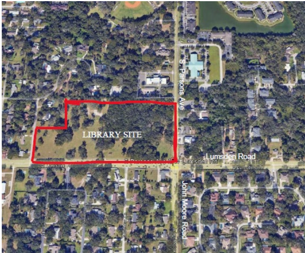
Parcel at N.W. corner of Parsons Avenue and Lumsden Road