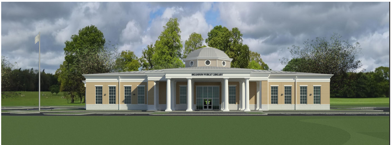
Principal (South) Elevation